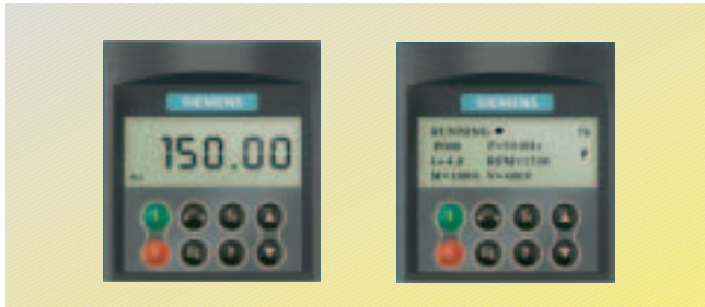
Basic Operator Panel (BOP) and Advanced Operator Panel (AOP)

It is mounted in the operator panel mounting kit, for connection to the external communication interface of the inverter.