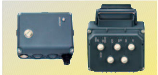
AS-Interface Module and PROFIBUS Module

The module is enclosed in an external housing.